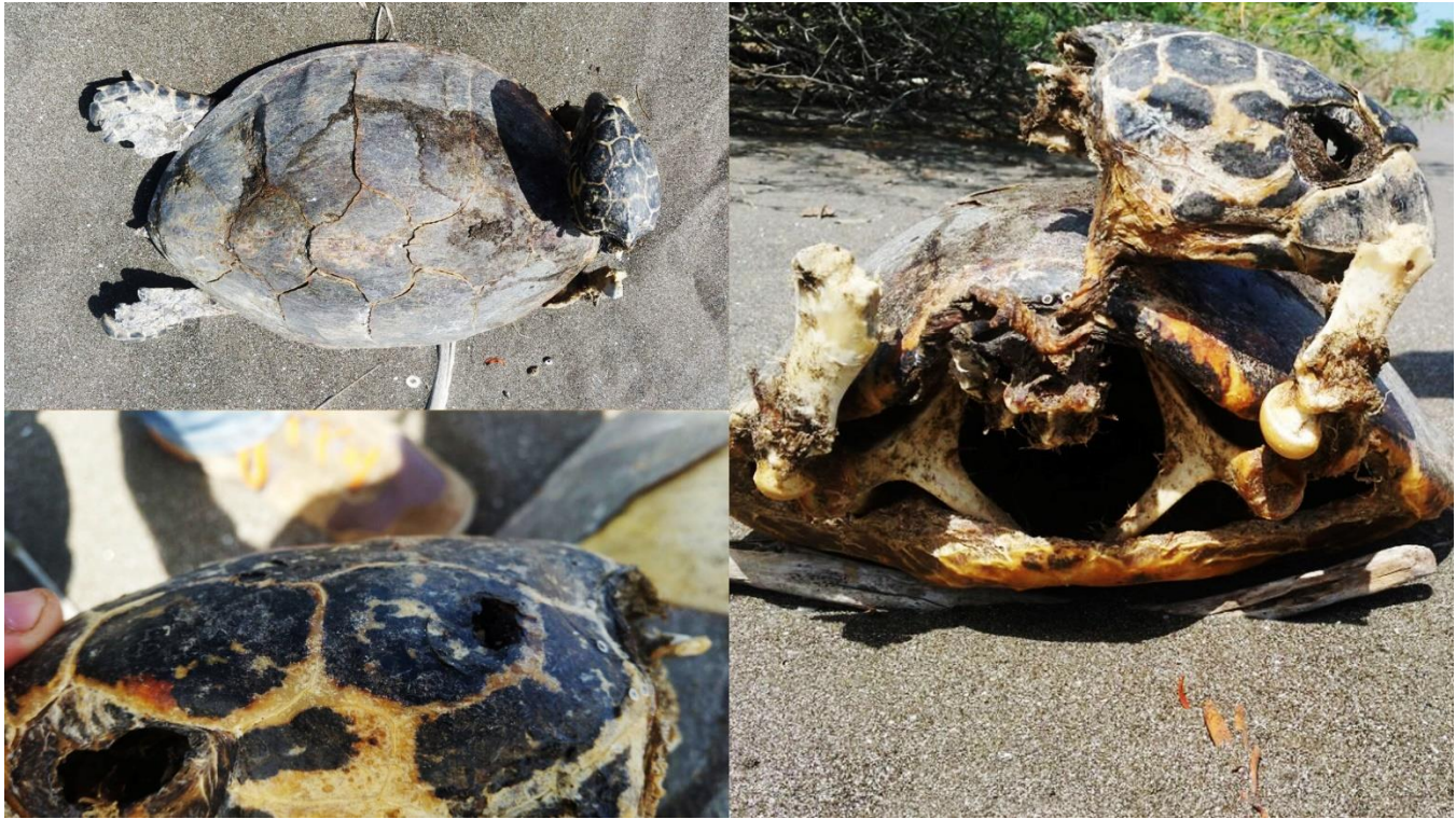
Figure 2. Individual of Eretmochelys imbricata predated by a jaguar at Potrero Grande beach, Santa Rosa National Park, Costa Rica.