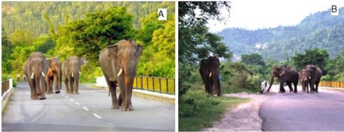
FIGURE 3. A, B. All-male group at Shyampur forest; Oldest male elephant, who leaded the group is walking in front in figure 3A and standing on the left side in figure 3B.

groups. Slowly, other male elephants, especially sub-adult males started associating with them and formed a stable group of all-male elephants, ranging from 2-10 individuals. Before this study, the second author documented an all-male group size up to eight individuals firstly during 2006-2010 from the area; but, considering the observations since the year 2010, it appears that the number of individuals in the group is increasing.