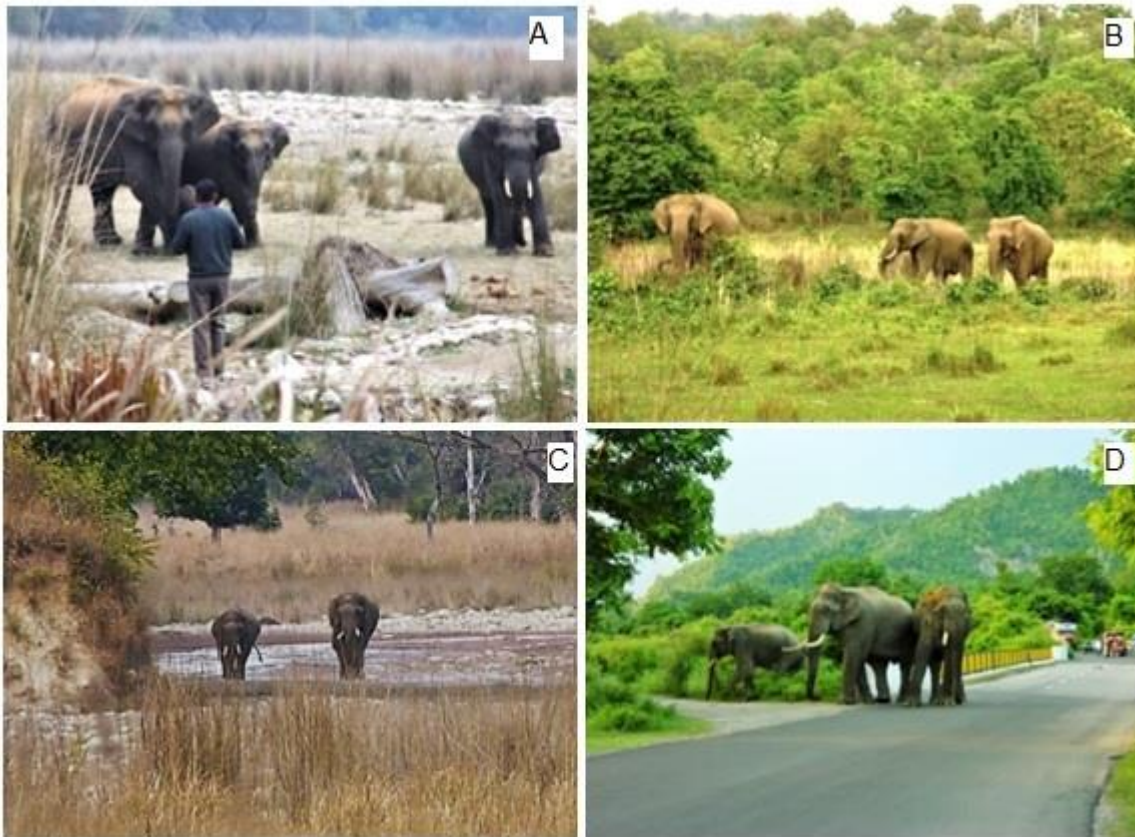
FIGURE 1 A, B. Observations on the focal adolescent male elephant during 2007-2011 in Rajaji National Park and adjoining protected habitats, north India; adolescent male elephant in a matriarchal elephant group having adult and sub-adult female elephants. 1 C, D. Focal adolescent male associating with an adult male elephant and all-male group, while moving towards the River Ganges.