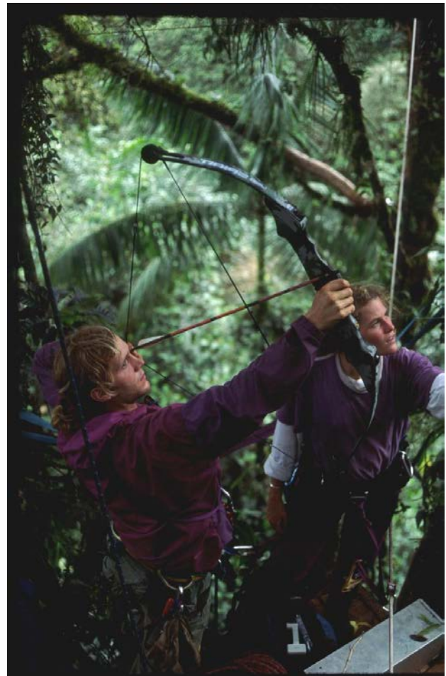
Figure 2. Photograph of authors deploying a rope between trees to access the canopy between the crowns of tall emergent.