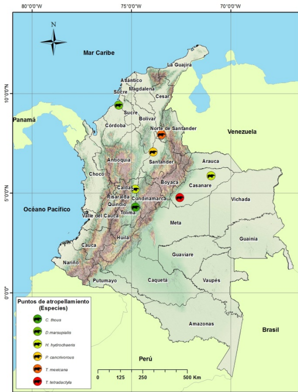
Figura 1. Distribución de los reportes de atropellamiento por especie en Colombia.