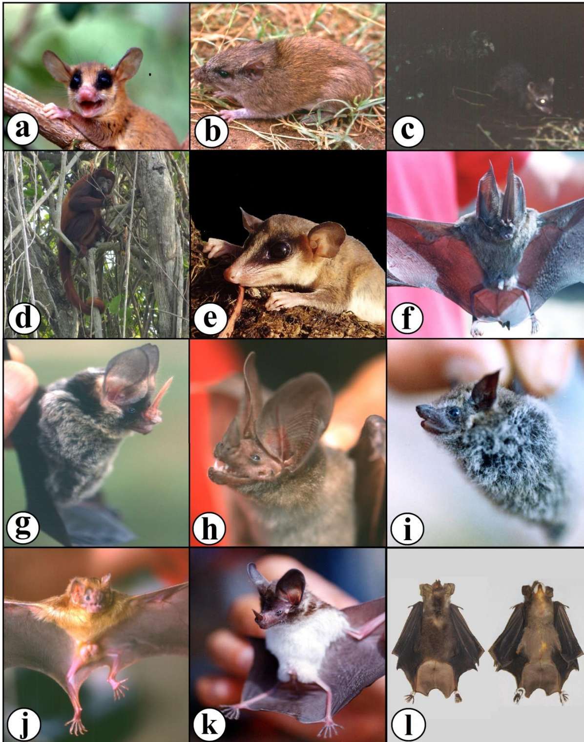
Figure 3. Representative mammal species inventoried in sampling sites at Campo Boscán, middle basin of the Palmar River in Zulia state, Venezuela. Letters correspond to: Marmosa robinsoni (a); Proechimys canicollis (b); Procyon cancrivorus (c); Alouatta seniculus (d); Marmosa murina (e); Lonchorhina aurita (f); Mimon crenulatum (g); Lophostoma silvicolium (h); Rhynchonycteris naso (i); Desmodus rotundus (j); Micronycteris schmidtorum (k); Micronycteris hirsuta (l).